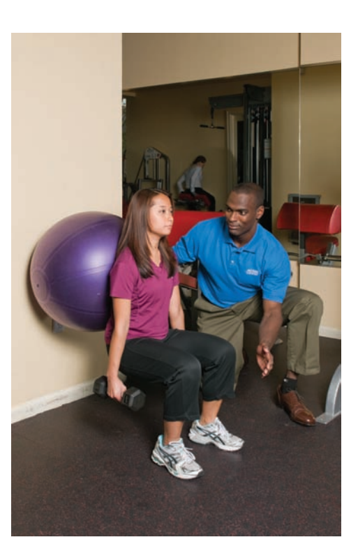
FIGURE 1.4. A trainer spotting a squat exercise of a client who is on a bosu ball (with light dumbbells in each hand).